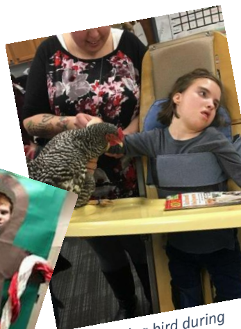
Student petting bird during animal lesson