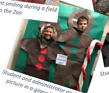
Student and administrator posing for picture in a gingerbread cutout.