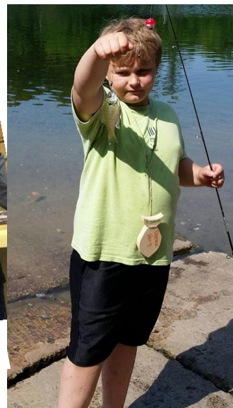
Student showing off the fish he caught at Camp