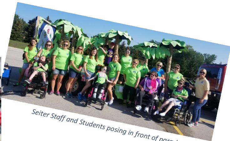
Seiter Staff and Students posing in front of parade float.