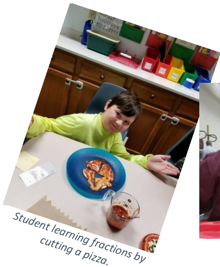
Student learning fractions by cutting a pizza.