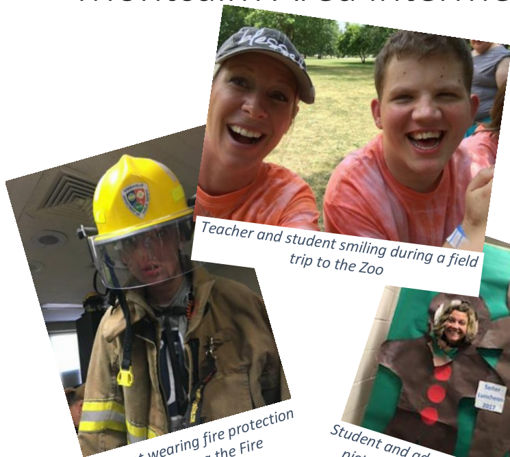
Teacher and student smiling during a field trip to the Zoo

Montcalm Area Intermediate School District