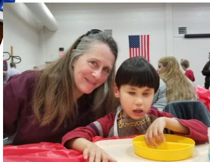
Student with his parent